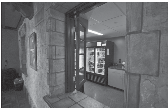
The concessions area improvements include new coolers.