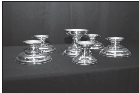
The brass fixtures were covered in paint.

"When the college took the Palladium over last fall, it was really in pretty good shape, but the previous owner, a non-profit, did not have the money to maintain it, and the building needed a fair amount of work,"