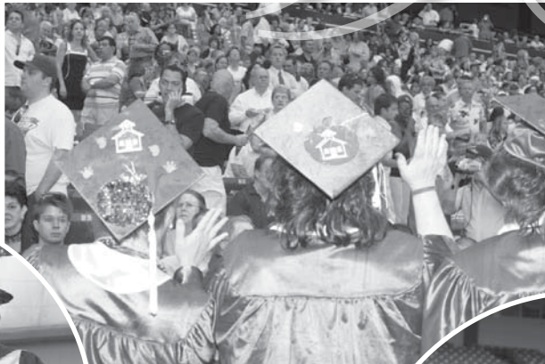
Graduates from the College of Education made themselves visible in the crowd.