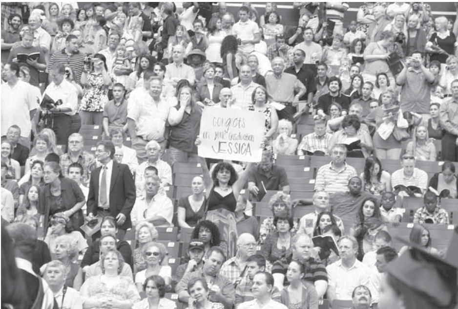
Thousands cheered the graduates from the stands.