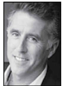
Christopher Kennedy Lawford

Call 813-915-7447 for reservations. Tickets are $50 each.