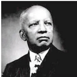
Carter G. Woodson

Since the beginning of February, students, staff and faculty on all campuses have enjoyed the tastes and cultural delights of African American History Month.