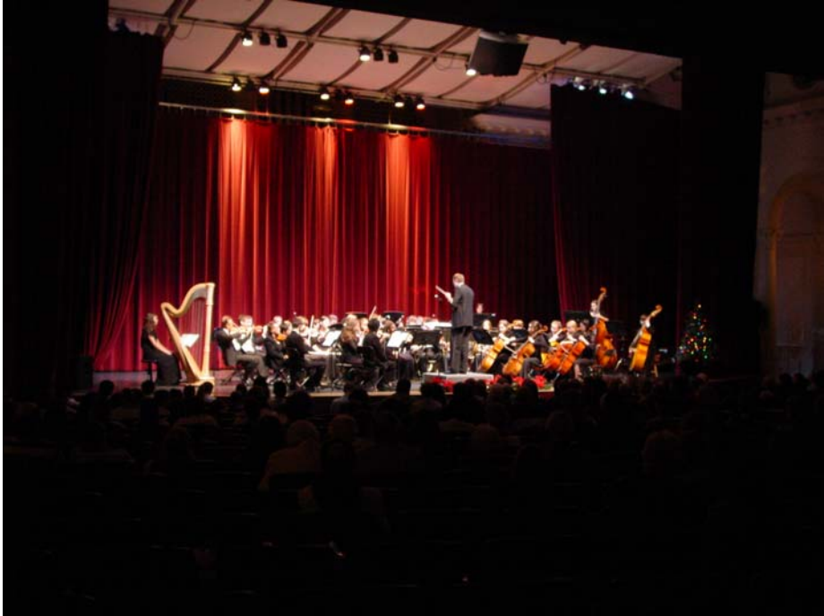
Side Door Cabaret