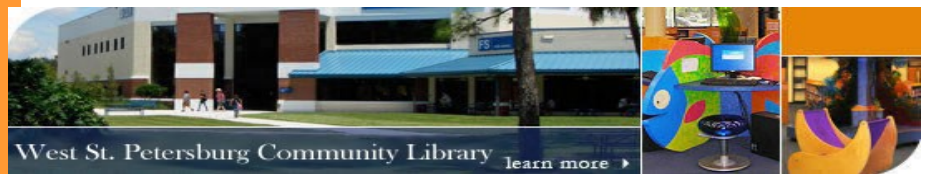
West St. Petersburg Community Library Learn more

Phone: 341-7199 Monday—Thursday 7:30 a.m. to 9:00 p.m. Friday 7:30 a.m. to 4:00 p.m. Saturday 10:am to 5:00 p.m. Sunday Closed